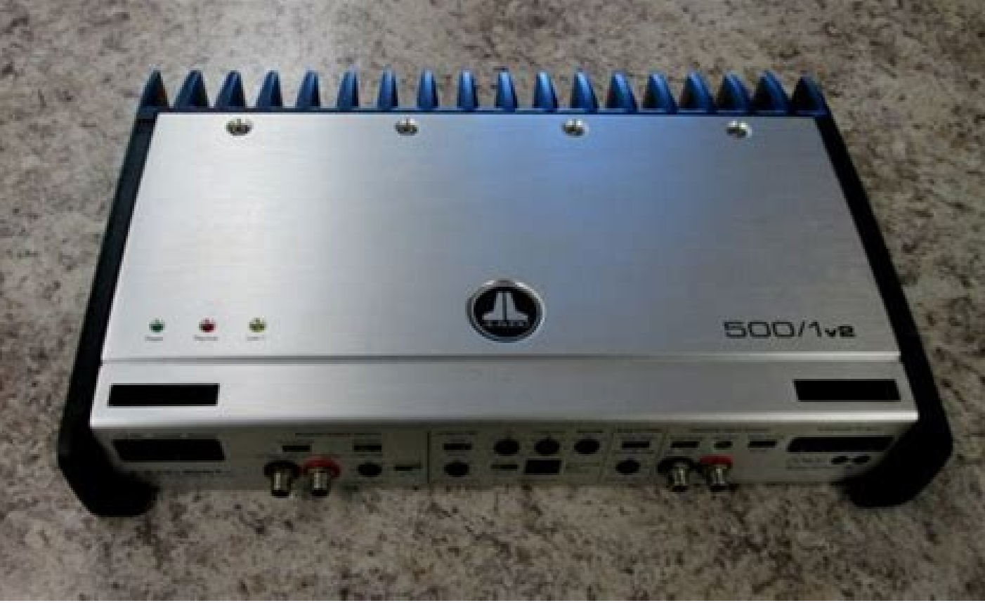
Jl 500/1 slash. Jl jx500/1. Jl 500/1. Jl 500/1 marine amp. Jl 500/1v2. Jl 500/1d. Jl 500/1 manual. Jl 500/1 bass knob.